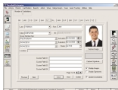
Cardholder Screen with Image