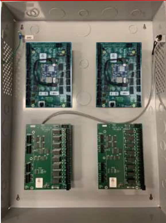
The 2700 includes 4 supervised or unsupervised inputs and 4 auxiliary outputs with field replaceable relays, expandable via daisy chain up to two 170 I/O expansion boards per 2700 controller.